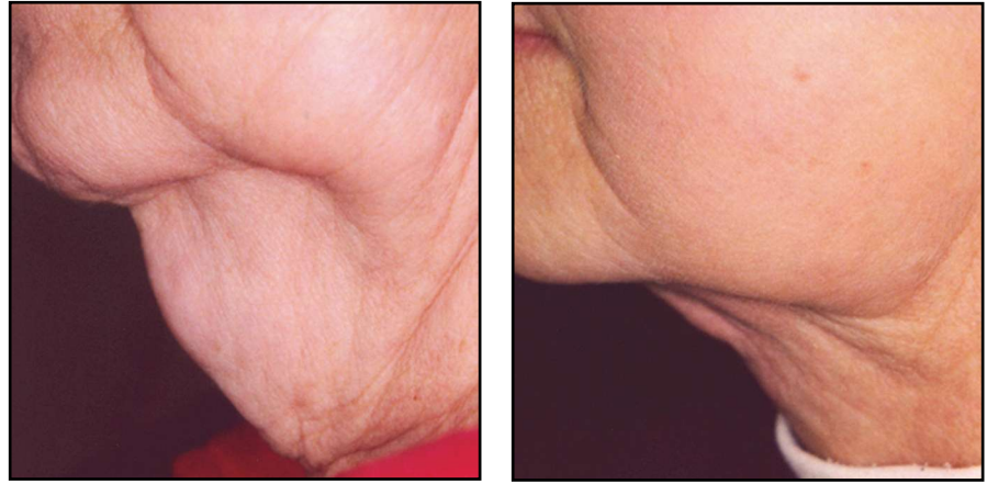
Figure 4. Under chin treatments, before and after (4 treatments)