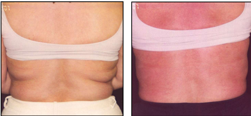
Figure 2. Bra/back fat treatments, before and after (4 treatments)